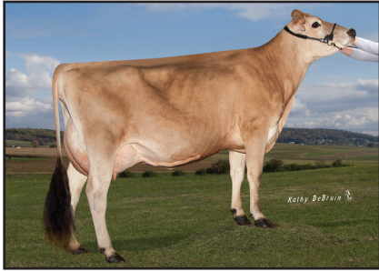
JX TLJ VISIONARY BREE {4}-ET Great-grandam of Lot 4A