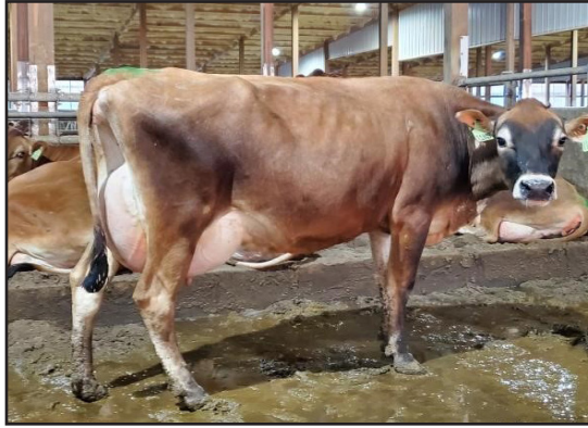
ROC-BOT CHIEF 11809 DAM OF LOT 2