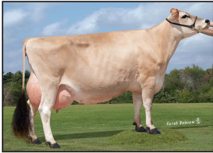
JX TLS BRITANY BOBBI J DALE {3} Fourth Dam of Lot 4A

BORN 08/08/2021 P9 BBR 100 FEMALE EFI 8.9% AMERICAN ID 2786/2786 JH1F JNSF A2A2