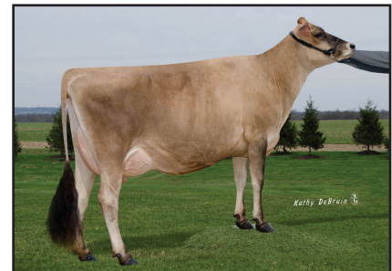
JX PINE-TREE AVON DELLA {3}-ET Sister of Grandam