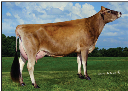
AHLEM VIABULL VANITY 5057-P Dam of Pine-Tree 5057 Dalton 2271-PP-ET