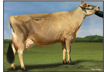
OAKLANE CHISEL DELLA 2130-ET Great-grandam of JX Pine-Tree 2054 Gislev 2898 {5}-ET