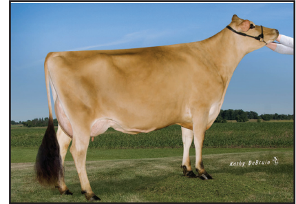
JX PINE-TREE WORLD CUP DELLIA {5}-ET Grandam of JX Pine-Tree 2054 Gislev 2898 {5}-ET

SUNSET CANYON DZZLER V MAID 2348 90% 6-01 305 2 24500 6.2 1521 4.1 1008 100DCR 3491C