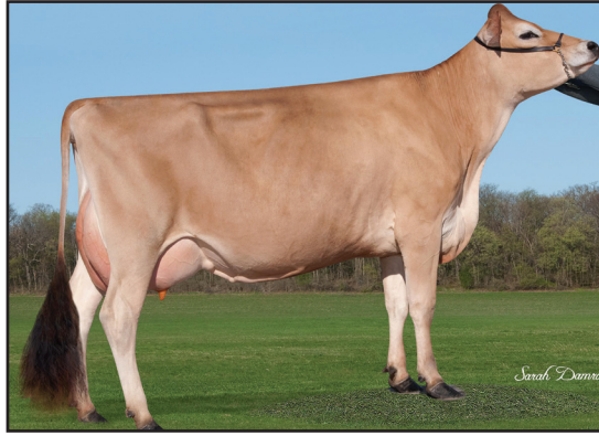
SCENIC VIEW BARNABAS MAID-ET, E-90% FOURTH DAM OF LOT 4B