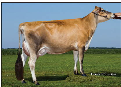
AHLEM TITAN VANITY 1245 Sister of Grandam

BORN 01/13/2020 P8 BBR 100 FEMALE EFI 9.1% AMERICAN ID 2271/2271 JH1F JNSF A2A2