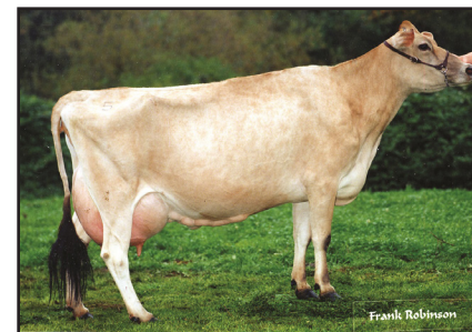
TENN HAUG E MAID, E-93% Same Family as Lot 4B

KASH-IN CHROME 47024-ET 80% JE840003131679220 GT13K BBR 100 JH1F JNSF DHIA HERD # 93-54-0855 CONTROL # 47024 1-11 301 3 18050 5.9 1063 4.1 747 94DCR 2587C 2-10 305 3 18400 5.6 1026 4.3 800 94DCR 2756C 305 2X ME AVG 3L 18328M 1043F 767P 2657C PPA -711M 105F 61P / YD -325M 102F 61P CDCB GPTA S 01/04/2022 3RECS 86%R 98%ILE -138M 0.24% 43F 0.14% 25P 482CM$ 460NM$ 317FM$ 3.5PL -0.2LIV 0.2DPR 1.2CCR 1.2HCR 2.76SCS 435GM$ 0.0MFV 0.3DAB 0.0KET 0.1MAS 0.3MET 0.1RPL 1.70HTI AJCA 01/04/2022 GPTAT 84%R 0.8 GJUI 3.0 GJPI 81%R 111