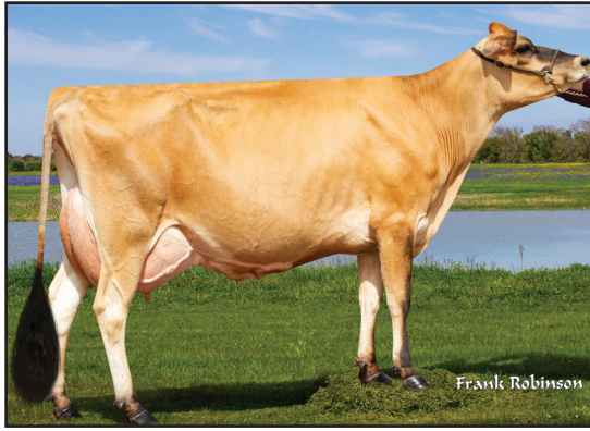
PRO-HART CHROME LORETTA {6}, E-90% GRANDAM OF LOT 1