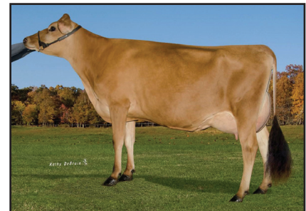
PINE-TREE LISTOWEL DELLA 1598-P-ET Sister of Grandam